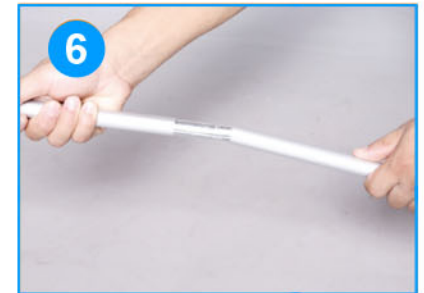
6. Fix the pole