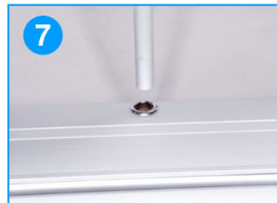
7. Insert the pole into the base