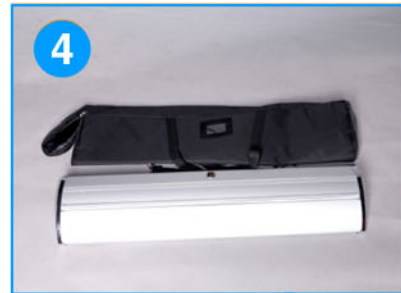
4. Put on the ground