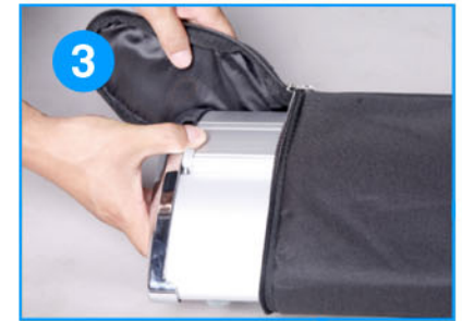
3. Take out the base from the bag