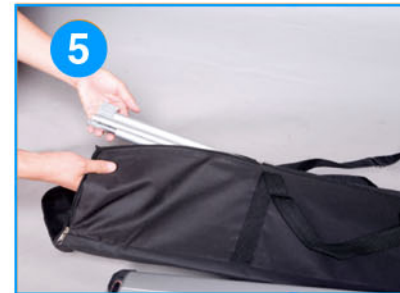
5. Take out the pole from the bag