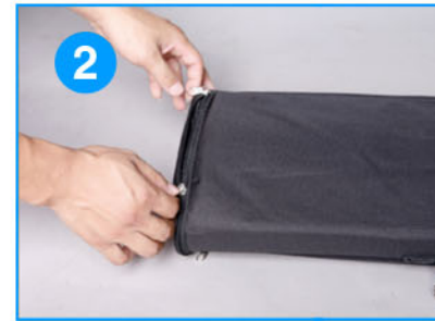
2. Open the bag like this