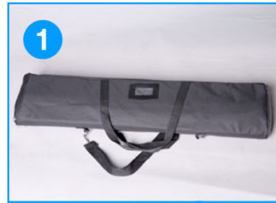
1. Bag with stands