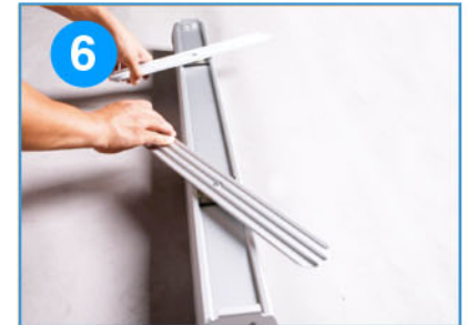
6. Open the feet and put the base on the ground