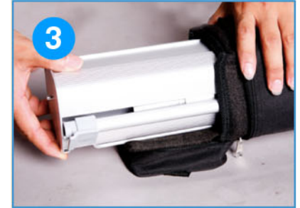
3. Take out the base from the bag