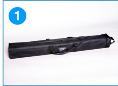
1. Bag with stands