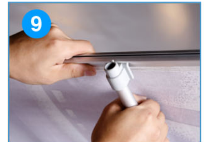
9. Fix the pole on the top bar