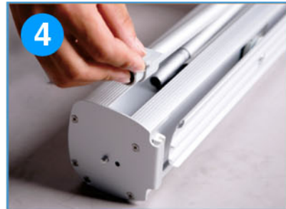
4. Take out the pole from the base