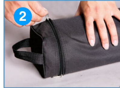
2. Open the bag like this