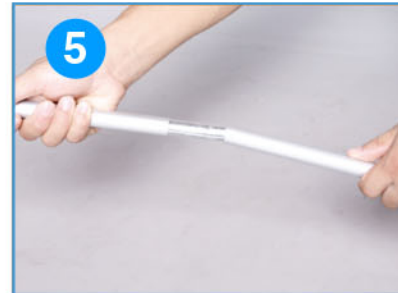
5. Fix the pole